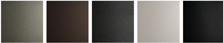
GFM11 titanium embossed