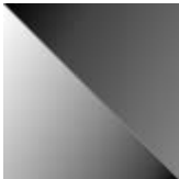
satin iron grey