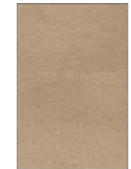
ZUP15020 Antique Bronze