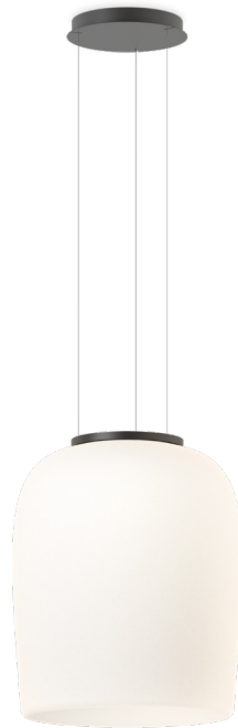
4987 Ø 47,5 cm